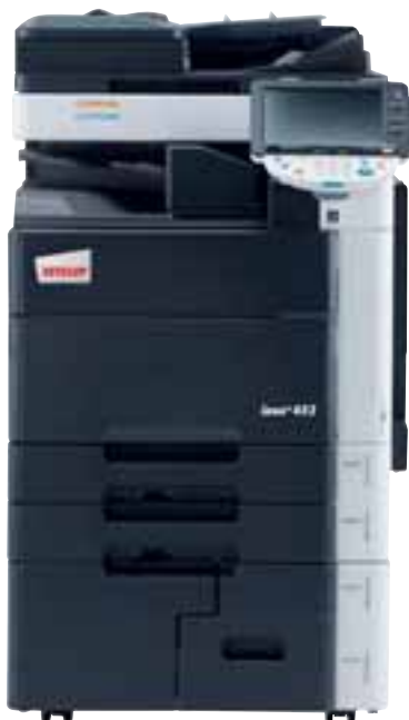
ineo+ 452 with job separator (JS-504)

One of DEVELOP's guiding principles is to show our responsibility for future generations by respecting the environment. The practical evidence is seen in the Blue Angel or Energy Star awards for devices such as the ineo+ 452. However, this system's environmental profile is exemplary in more ways than one. Production of the polymerised toner, for example, generates 40% fewer CO 2 emissions than that of conventional toner; more than 90% of DEVELOP's components can be recycled; and ineo systems only use electricity when they are actually operating and automatically switch off when not in use.