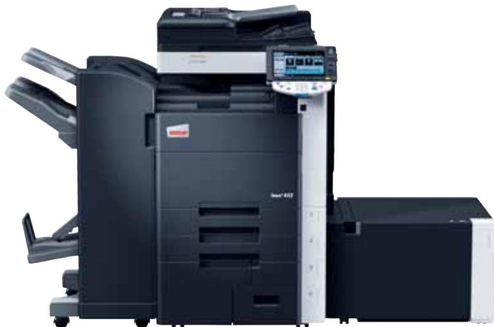
ineo+ 452 with staple finisher (FS-527), saddle kit (SD-509), and large capacity tray (LU-204)